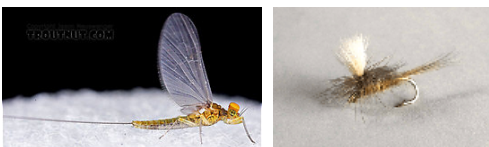
Blue Wing Olives

If you have time to register with the site and either enter flies or judge them, let us know what you think. We will then let the rest of our members know whether or not they should also make use of it.