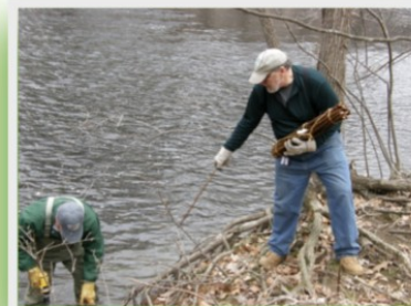
Planting willow trees for shade

We also participate in stream cleanup efforts, removing garbage and clutter from the water to aid in streams flows, and spreading woodchips in the parking areas for fishermen. In addition, we create better trout habitat through something called “Boulder propping”, which is laying boulders on the stream bed on top of one another to create places for trout to rest and wait for food.