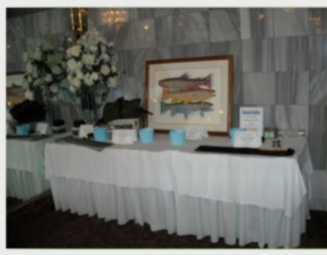
Some of the many raffle prizes