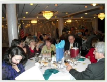
The gala annual formal EJTU dinner

We also have an annual barbeque and swap during one of our meetings where members can bring fishing gear they no longer want or need and swap it with another member for something they do want or need.