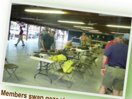
Members swap gear at an outdoor meeting

In addition to this, EJTU has its own monthly newsletter "Riffles", a sample of which is at the back of this information packet. Riffles discusses our local conservation efforts, educates members on issues of importance to them, recaps our recent activities, and provides a calendar of upcoming events of interest.