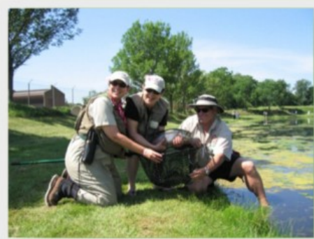
Her first Trout on a fly