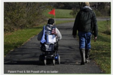
Helping a veteran to the water

Project Healing Waters Fly Fishing, Inc. is dedicated to the physical and emotional rehabilitation of disabled active military service personnel and veterans through fly fishing and fly tying education and outings.