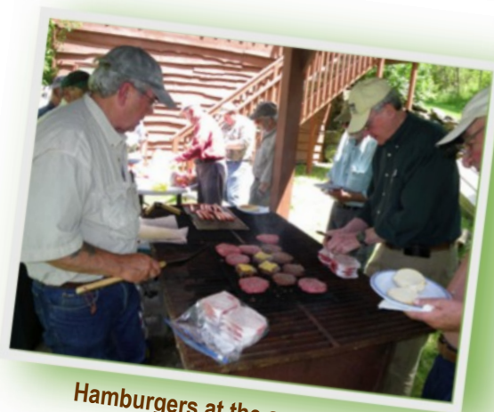
Hamburgers at the annual picnic