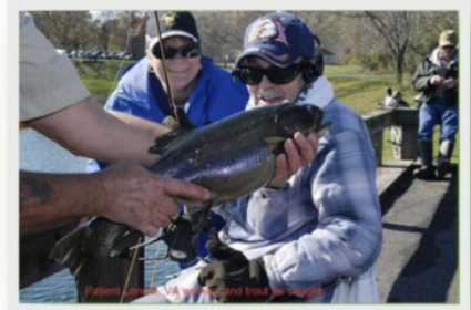
Success at the stream

Casting for Recovery® (CFR), a national 501(c)(3) non-profit organization, supports breast cancer survivors through a program that combines fly-fishing, counseling, and medical information to build a focus on wellness instead of illness.