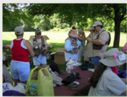
Preparing to fish