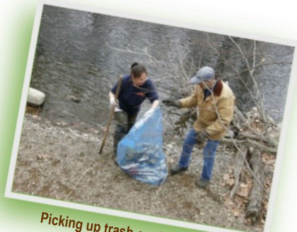
Picking up trash on the stream

The library display program is a mobile information and picture display showing facts about the sport of fly fishing and the history and activities of the East Jersey chapter of Trout Unlimited. The display is offered to public libraries in the area and stays on display for a prescribed period of time, then moves on.