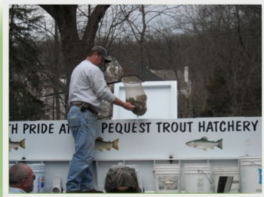
The hatchery truck arrives

This is a worthwhile and fun activity for members. Volunteers are awarded 10 points for assisting in stocking.