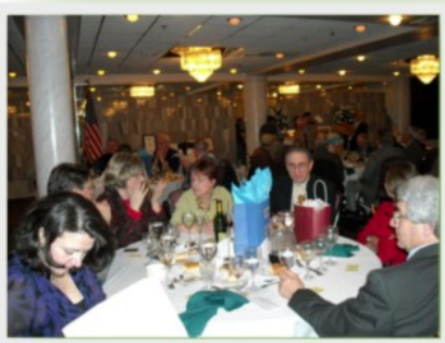
The gala annual formal EJTU dinner

prizes which raise money for our chapter. This is a formal affair and generally includes spouses.