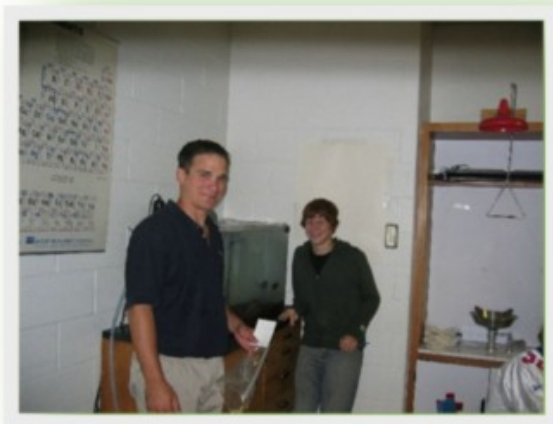
Setting up the tank in the classroom

Volunteer EJTU members take the eggs to select schools where they are deposited in aquariums environmentally suited for raising trout. In science classes, students study the environmental needs and life-cycle of the trout as they grow, which highlights issues such as water purity, temperature, and oxygenation. This is a fun and interesting way to teach students about the importance of environmental issues.