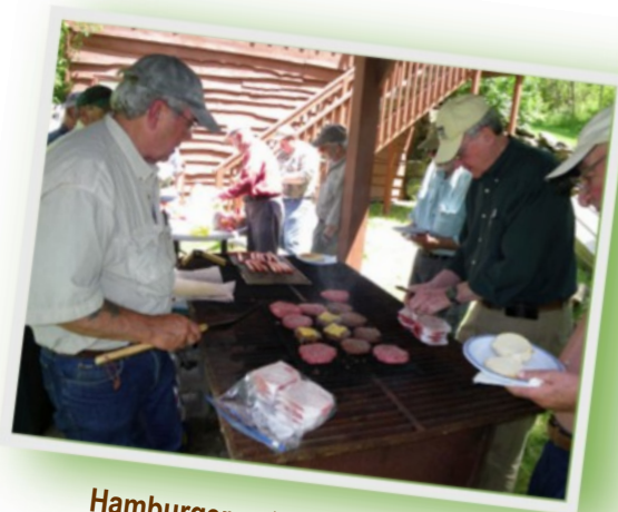
Hamburgers at the annual picnic