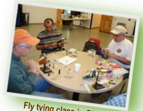
Fly tying class in Clifton

Expert members of EJTU provide classes to the public in Fly Fishing technique (casting, etc.) and Fly tying through adult education classes in Paramus and Clifton. These classes are given in the spring and fall of the year. People attending these classes often develop a lasting interest in our sport and become EJTU members