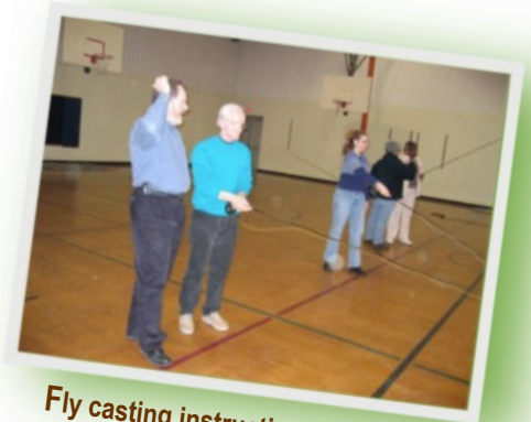
Fly casting instruction in Paramus