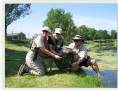
Her first Trout on a fly