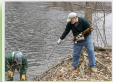
Planting willow trees for shade

We also participate in stream cleanup efforts, removing garbage and clutter from the water to aid in streams flows, and spreading woodchips in the parking areas for fishermen. In addition, we create better trout habitat through something called “Boulder propping”, which is laying boulders on the stream bed on top of one another to create places for trout to rest and wait for food.