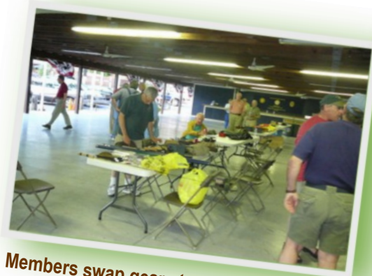
Members swap gear at an outdoor meeting

We also have an annual barbeque and swap during one of our meetings where members can bring fishing gear they no longer want or need and swap it with another member for something they do want or need.