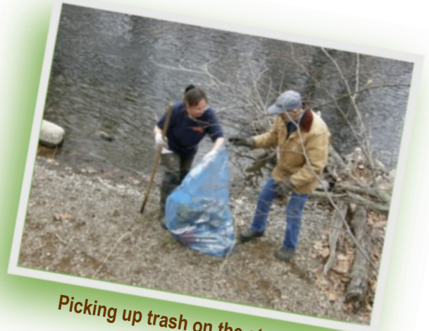
Picking up trash on the stream

The library display program is a mobile information and picture display showing facts about the sport of fly fishing and the history and activities of the East Jersey chapter of Trout Unlimited. The display is offered to public libraries in the area and stays on display for a prescribed period of time, then moves on.