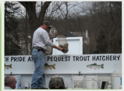
The hatchery truck arrives

This is a worthwhile and fun activity for members. Volunteers are awarded 10 points for assisting in stocking.