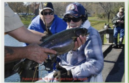
Success at the stream

Casting for Recovery® (CFR), a national 501(c)(3) non-profit organization, supports breast cancer survivors through a program that combines fly-fishing, counseling, and medical information to build a focus on wellness instead of illness.