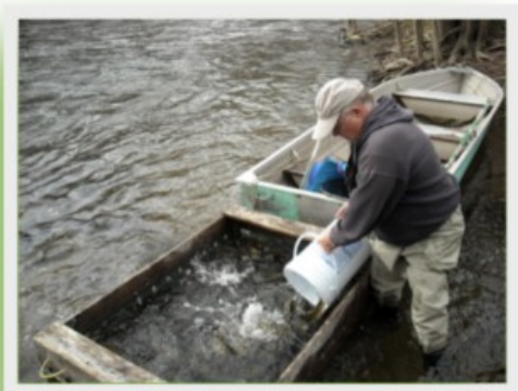
Preparing to float stock the Ramapo River