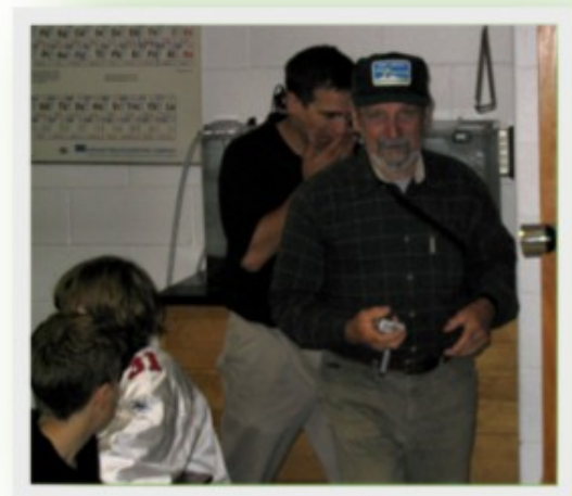
A TU member helps get things started