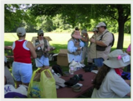
Preparing to fish