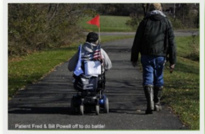
Helping a veteran to the water

Project Healing Waters Fly Fishing, Inc. is dedicated to the physical and emotional rehabilitation of disabled active military service personnel and veterans through fly fishing and fly tying education and outings.